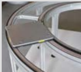
Pallet Conveyor Systems