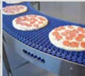
Stainless Steel Conveyors